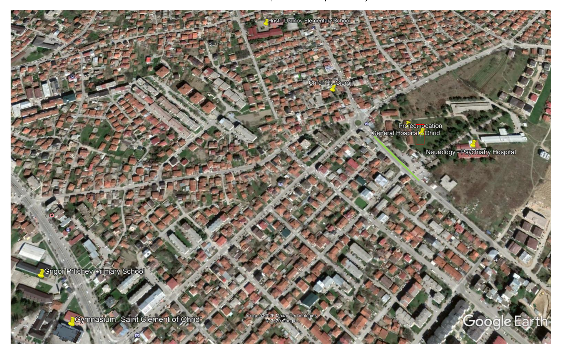
Figure 1 Micro location of the project area in Municipality of Ohrid