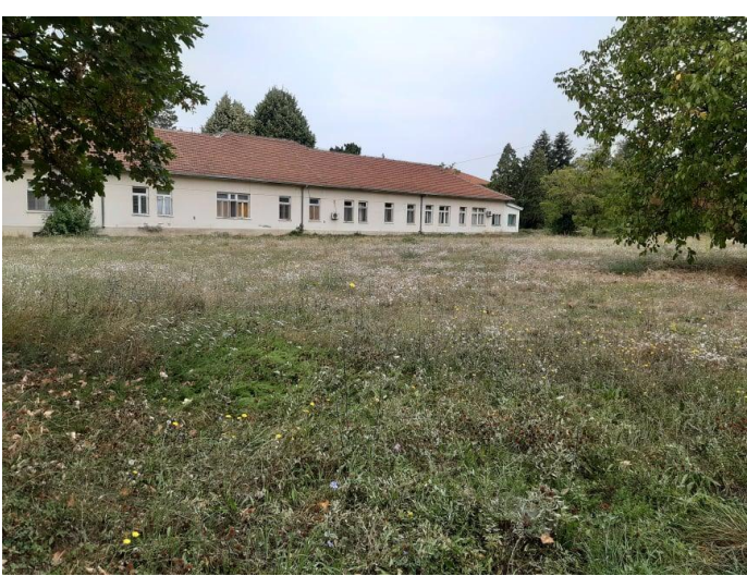
Figure 2 Pictures of the location were the mobile COVID 19 hospital will be installed